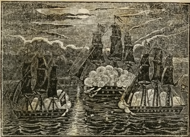
BATTLE OF THE CONSTITUTION WITH THE CYANE AND LEVANT. COMMODORE STEWART.